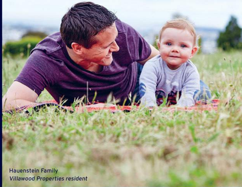
Hauenstein Family Villawood Properties resident

WANDANA is your opportunity to be a part of Geelong's premium new address, your time to live life at its peak. Superb connectivity to the freeway for weekend trips to the coast, or for an easy commute to Melbourne for work, is perfectly topped off with a stunning rural outlook across the rolling hills of the Ceres. With walking paths, cycling trails and the beauty of natural wetlands, Stage 4 is overflowing with lifestyle potential.