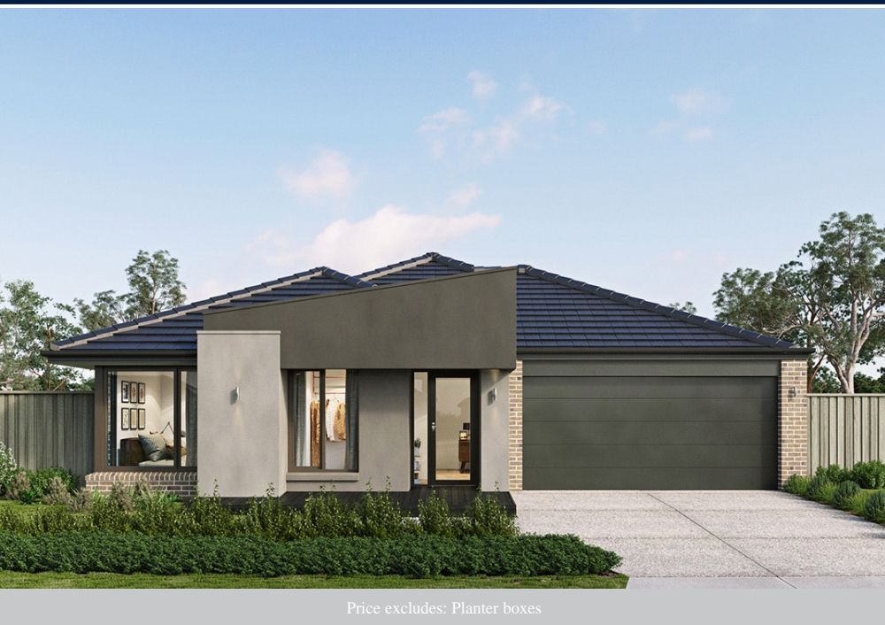
Price excludes: Planter boxes