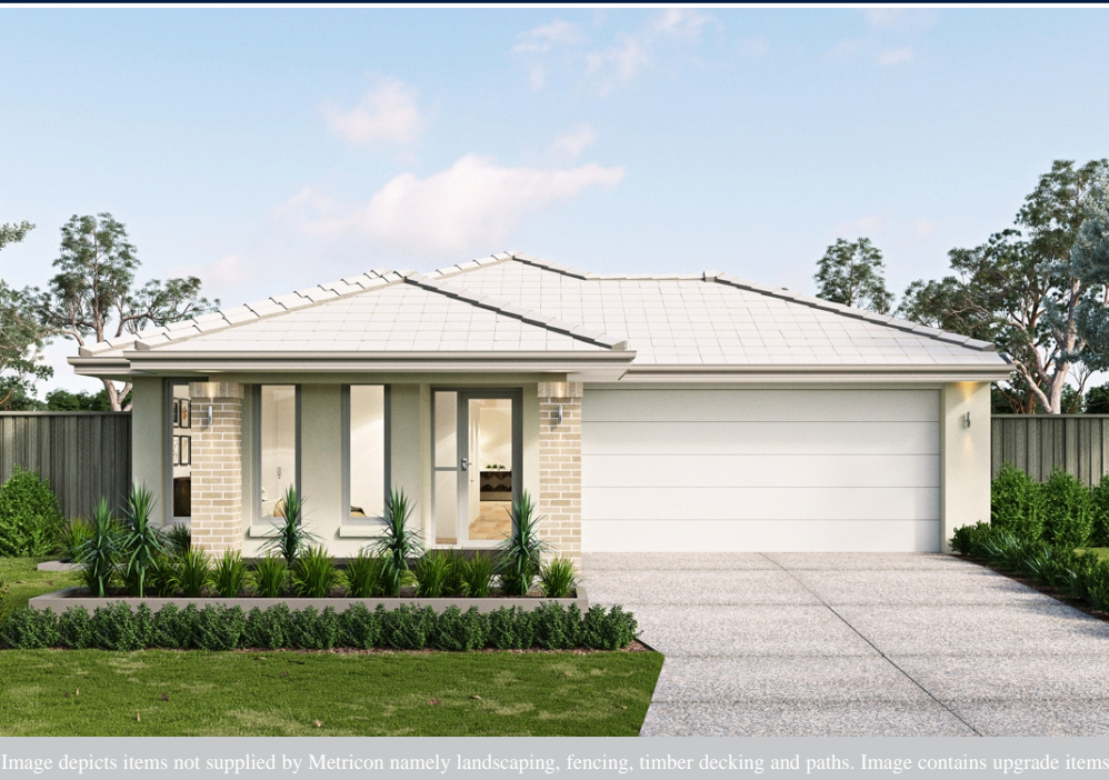
Image depicts items not supplied by Metricon namely landscaping, fencing, timber decking and paths. Image contains upgrade items.