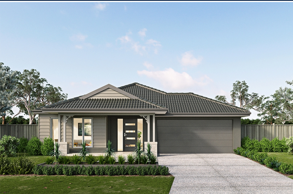
Image depicts items not supplied by Metricon namely landscaping, fencing, timber decking and paths. Image contains upgrade items.