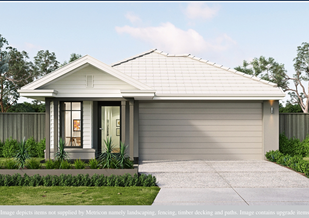
Image depicts items not supplied by Metricon namely landscaping, fencing, timber decking and paths. Image contains upgrade items.