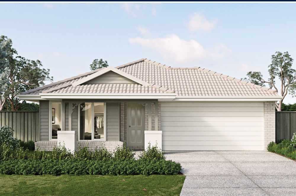
Image depicts items not supplied by Metricon namely landscaping, fencing, timber decking and paths. Image contains upgrade items.