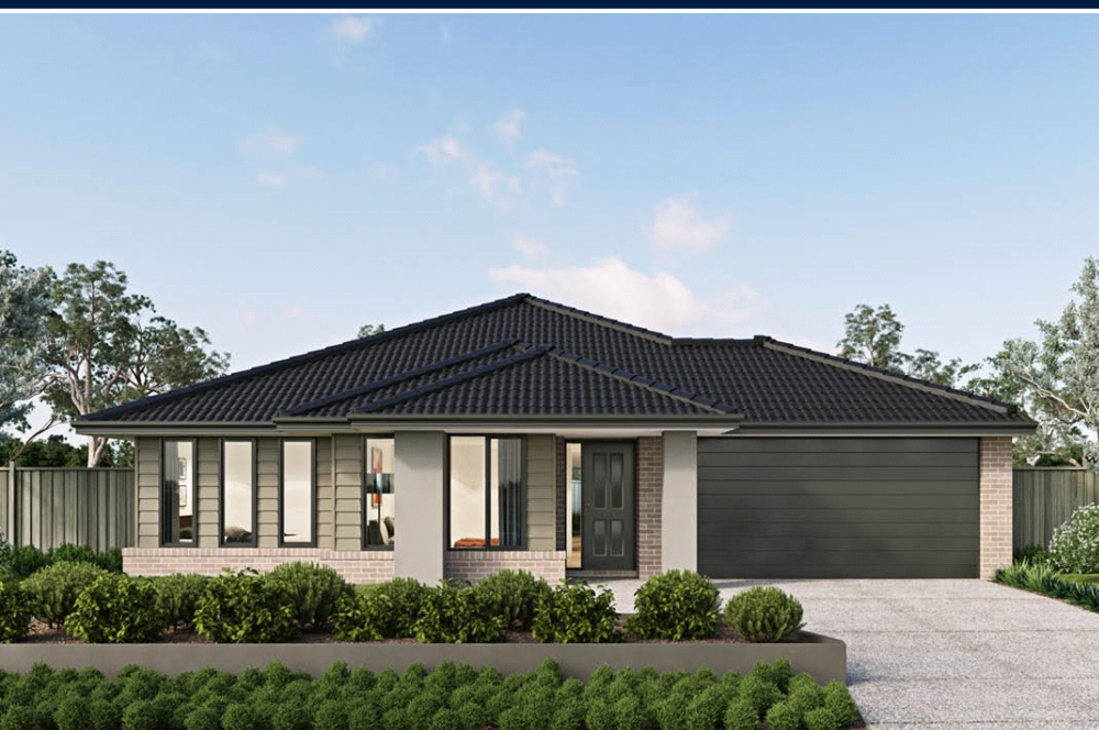
Image depicts items not supplied by Metricon namely landscaping, fencing, timber decking and paths. Image contains upgrade items.