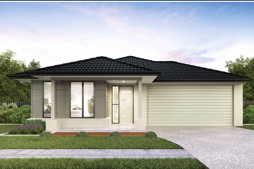
Image depicts items not supplied by Metricon namely landscaping, fencing, timber decking and paths. Image contains upgrade items.