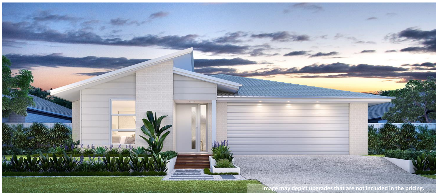
Image may depict upgrades that are not included in the pricing.

Floor area: 222.32m 2 / 23.93sq | Block size: 585m 2 Address: Lot 309 Iris Lane, Cumbalum NSW 2478