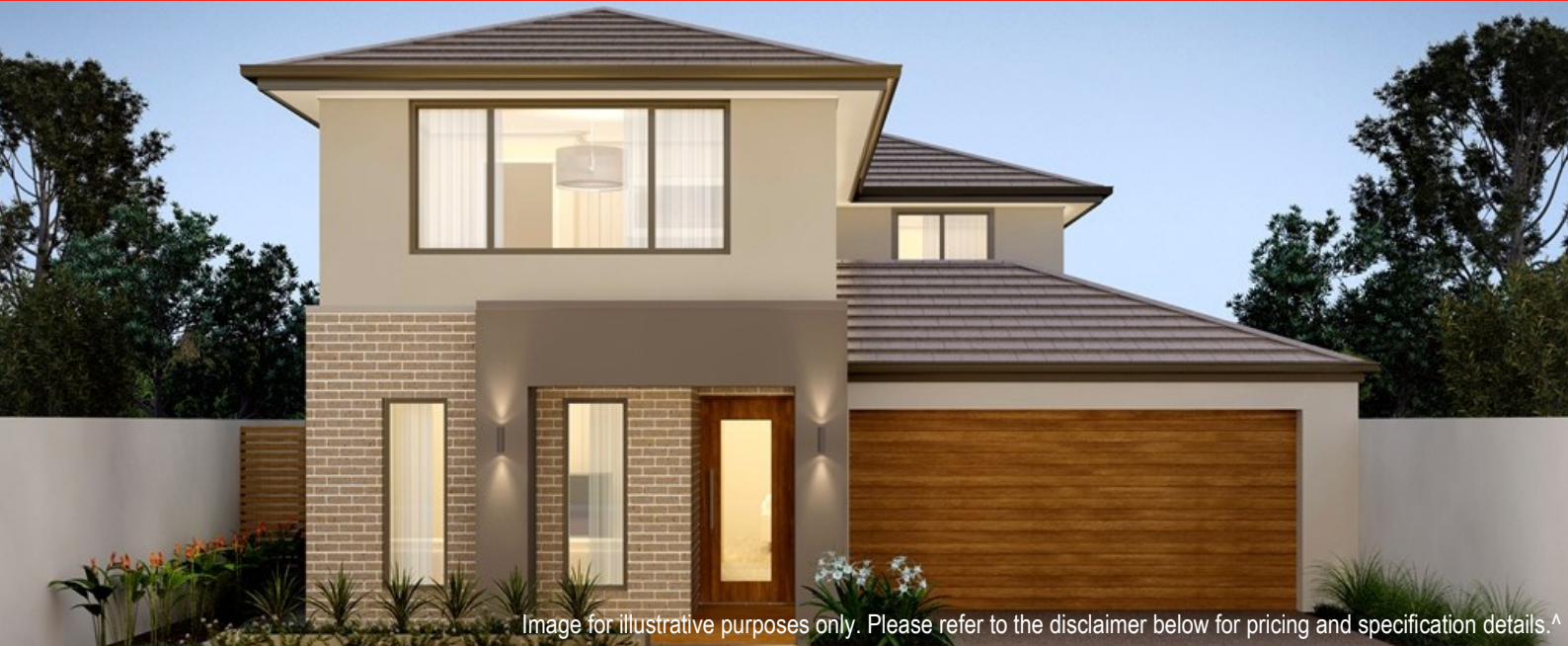
Image for illustrative purposes only. Please refer to the disclaimer below for pricing and specification details. ^