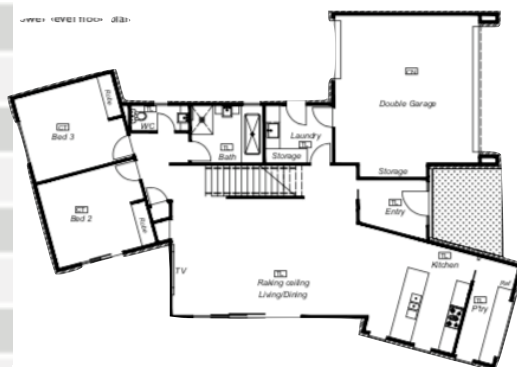
3D FLY THROUGH