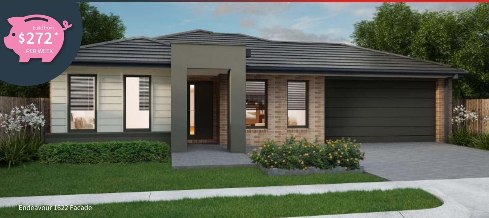
Endeavour 1622 Facade

LOT 4606 VERNAL DRIVE , ARMSTRONG , MOUNT DUNEED