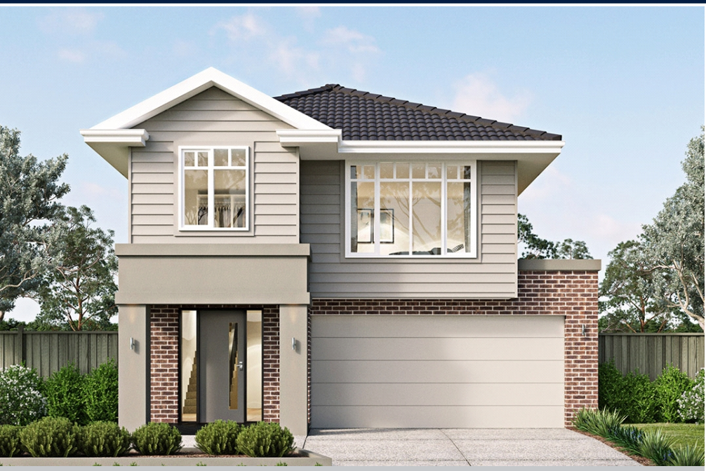
Price excludes: Fencing Landscaping Concrete payers Planter boxes Deckin