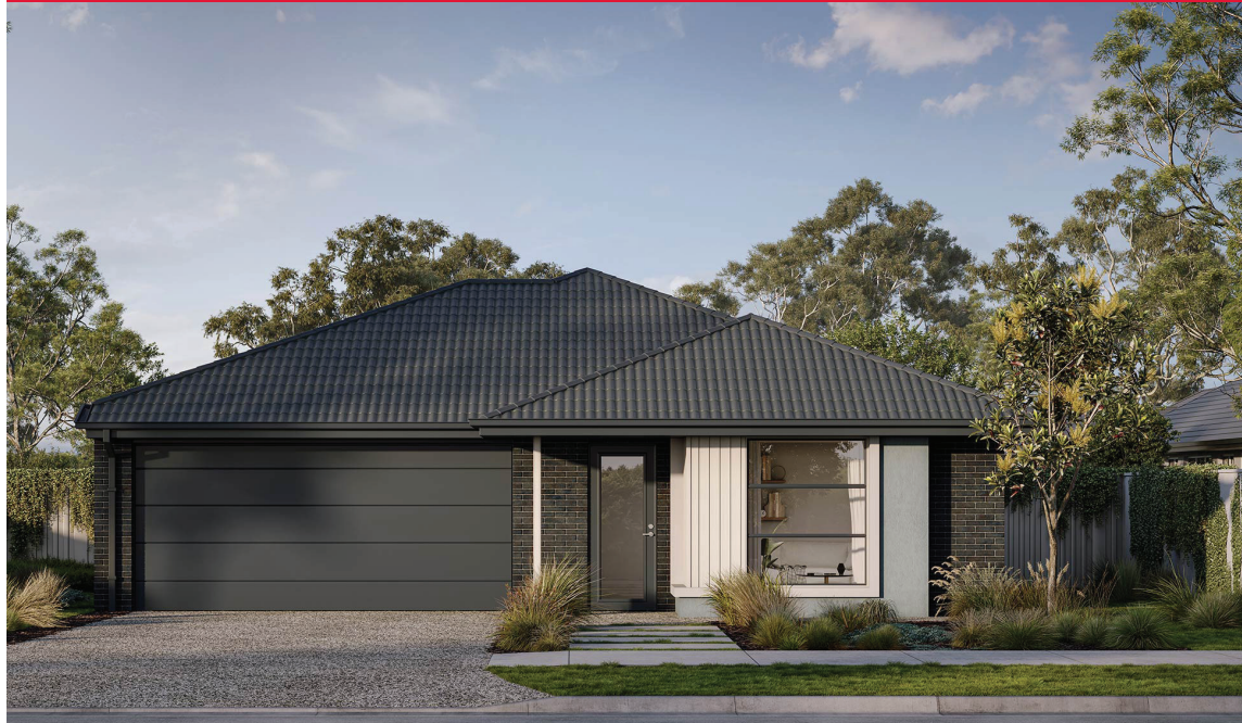
GRANITE 19 | EMERGE RANGE