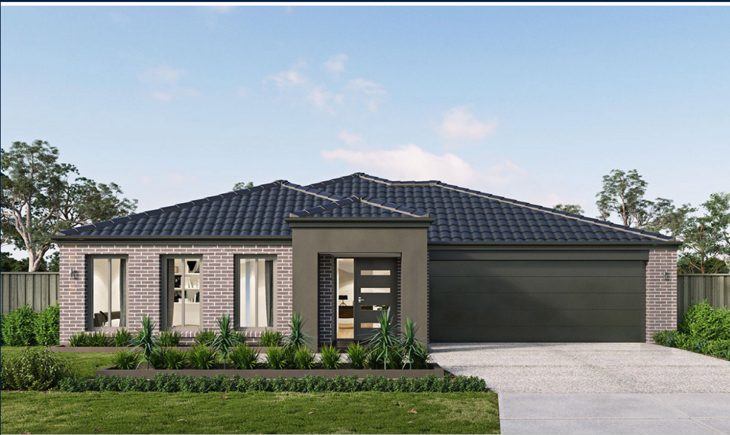
Price excludes upgrade items above standard specification such as feature render and bricks, front entrance timber decking, front entry door, brick infills above garage, external lighting, fencing, concrete paths and driveway. Facade Image may also contain items not supplied by Metricon Homes, namely landscaping and planter boxes.