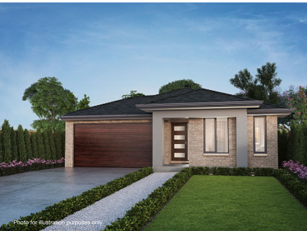
Photo for illustration purposes only.