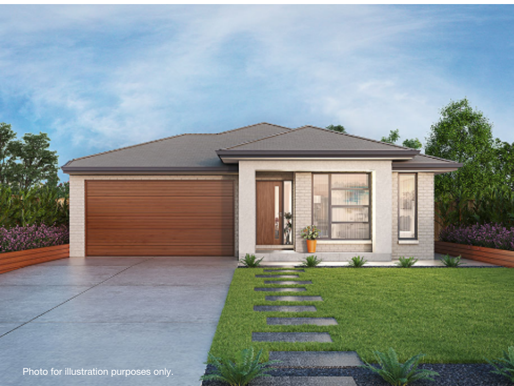
Photo for illustration purposes only.