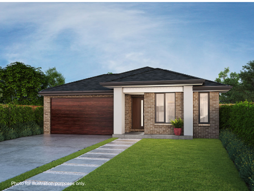
Photo for illustration purposes only.