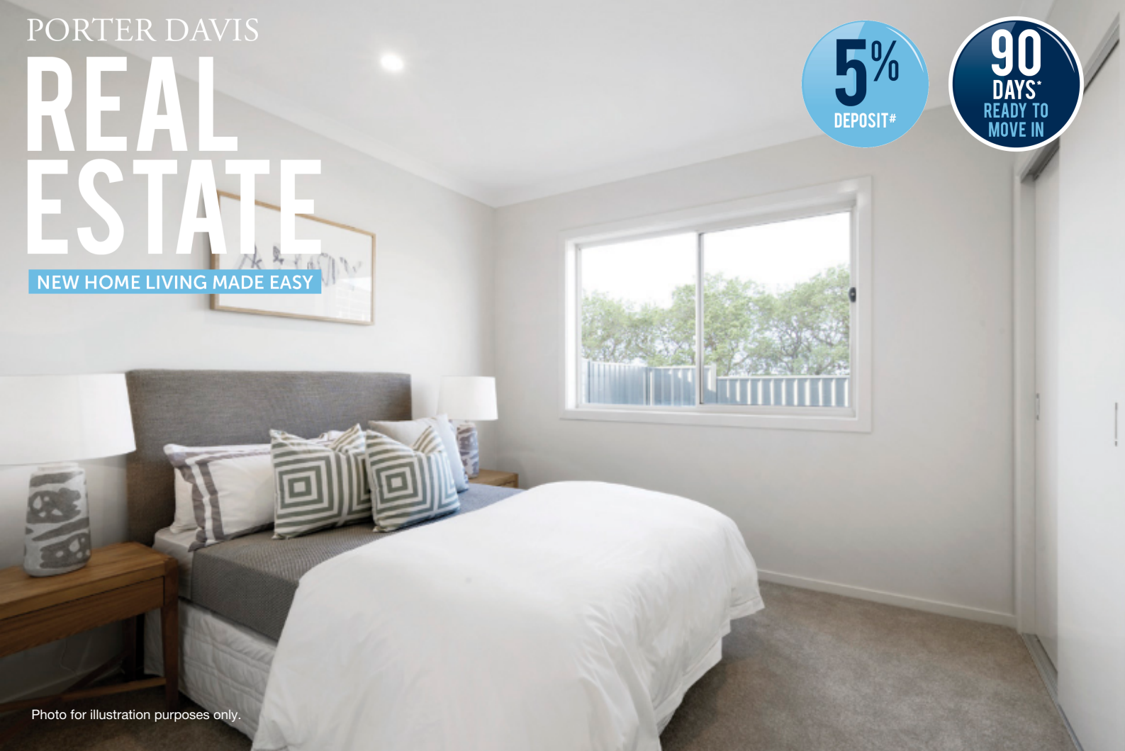
Photo for illustration purposes only.