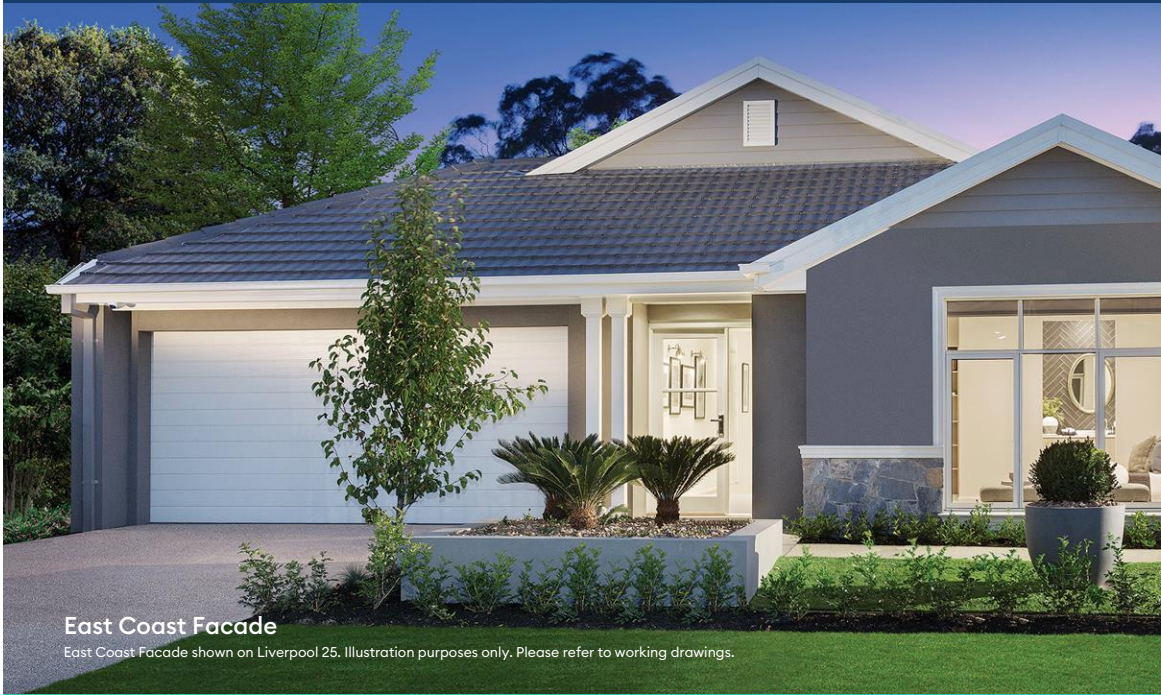
East Coast Facade

East Coast Facade shown on Liverpool 25. Illustration purposes only. Please refer to working drawings.