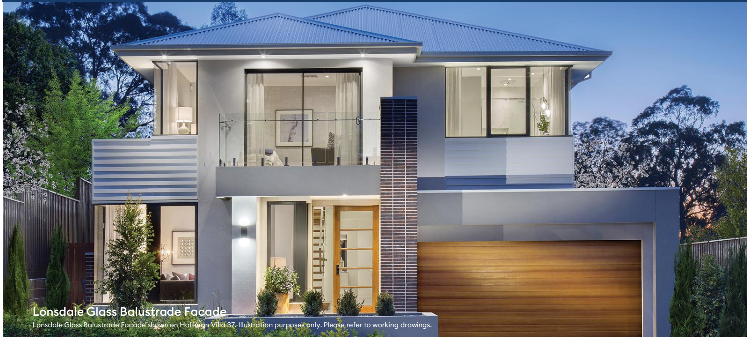
Lonsdale Glass Balustrade Facade

Lonsdale Glass Balustrade Facade shown on Hoffman Villa 37. Illustration purposes only. Please refer to working drawings.