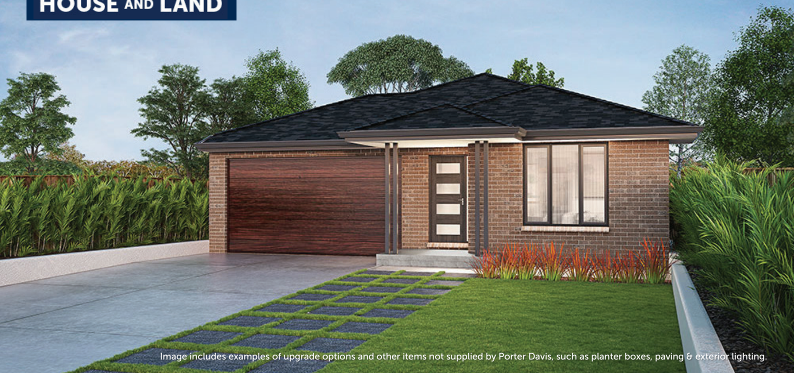
Image includes examples of upgrade options and other items not supplied by Porter Davis, such as planter boxes, paving & exterior lighting.