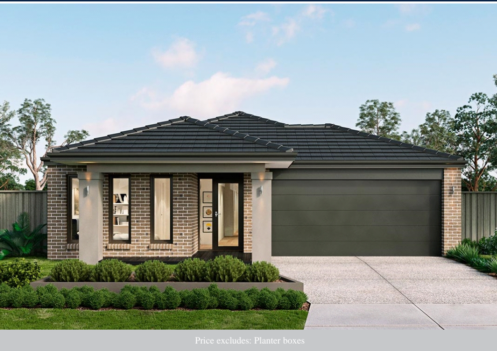
Price excludes: Planter boxes