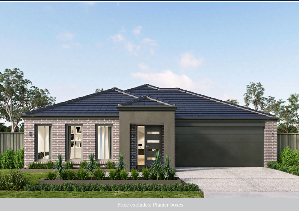
Price excludes: Planter boxes