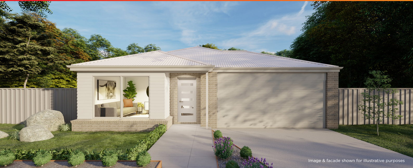
Image & facade shown for illustrative purposes