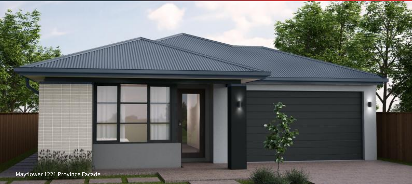
Mayflower 1221 Province Facade

LOT 1402 ONTARIO PARADE, TRILLIUM, MICKLEHAM