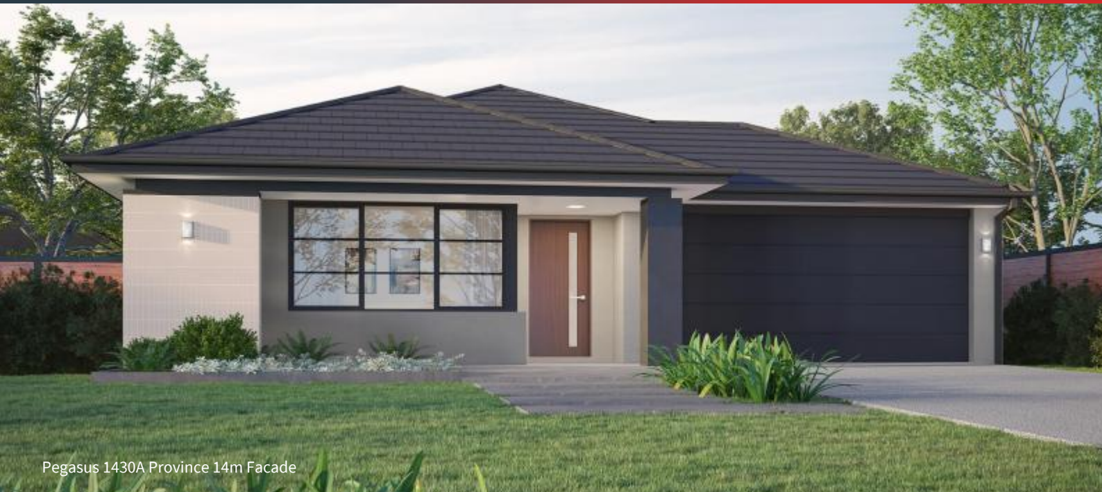
Pegasus 1430A Province 14m Facade

LOT 1406 LEAF STREET , TRILLIUM , MICKLEHAM