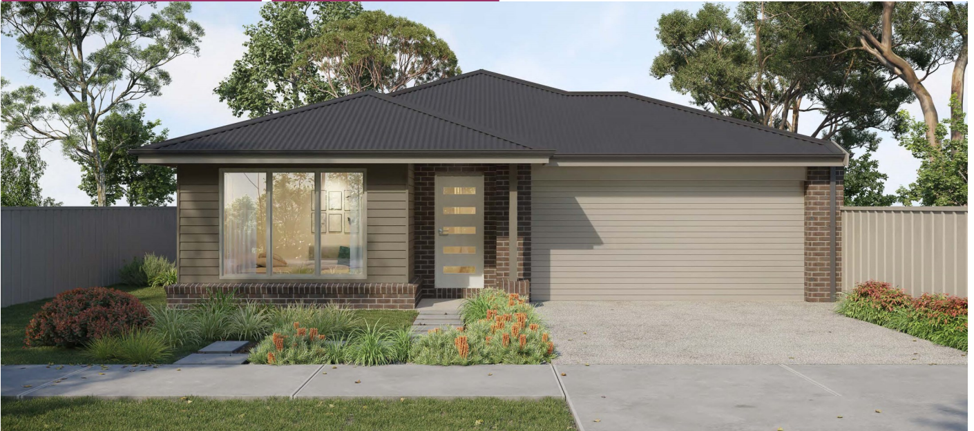
Image & façade shown for illustrative purposes