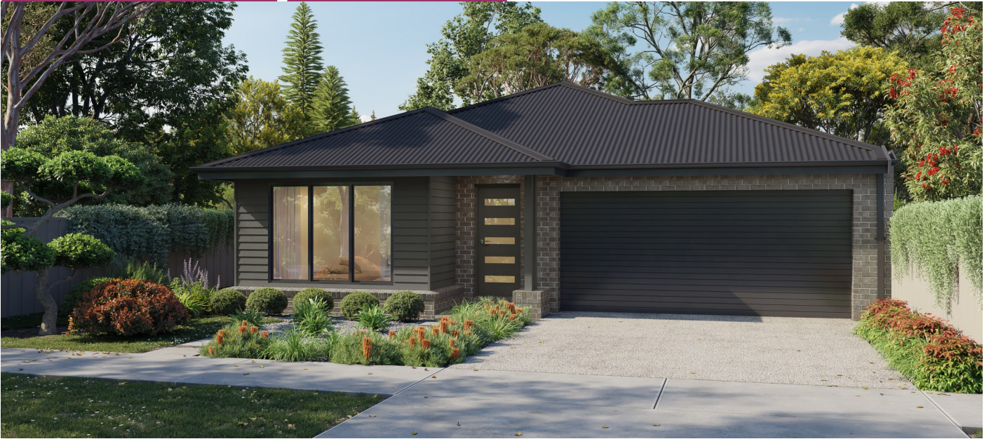
Image & façade shown for illustrative purposes