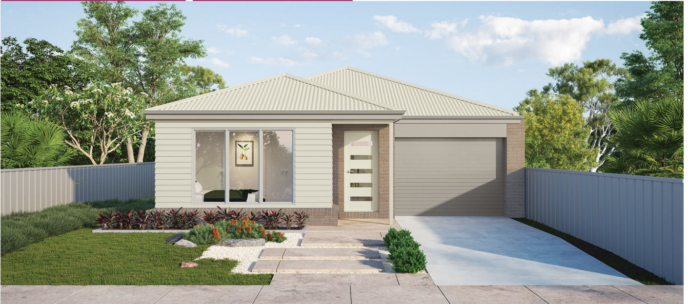
Image & façade shown for illustrative purposes