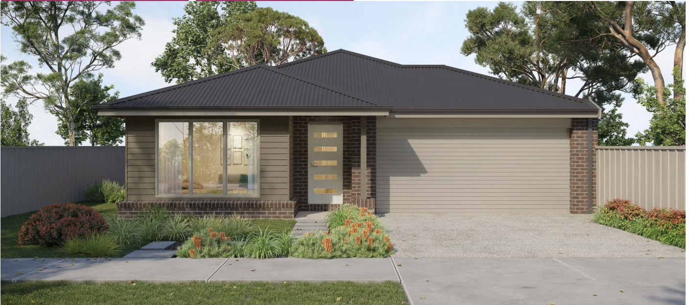
Image & façade shown for illustrative purposes