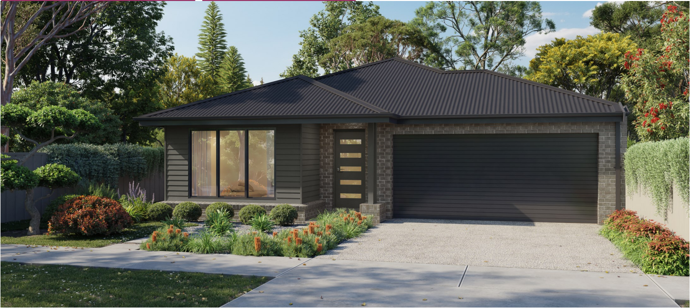
Image & façade shown for illustrative purposes