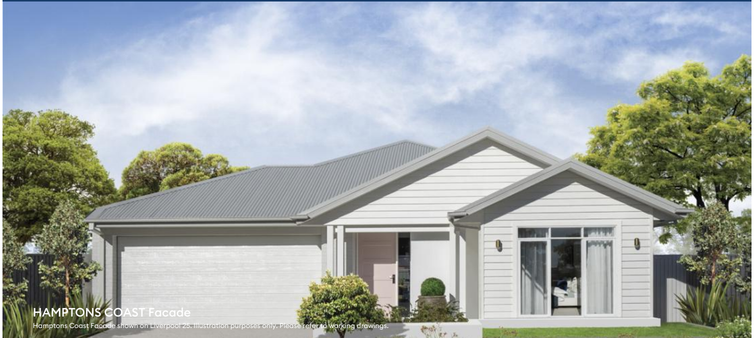
HAMPTONS COAST Facade

Hamptons Coast Facade shown on Liverpool 25. Illustration purposes only. Please refer to working drawings.