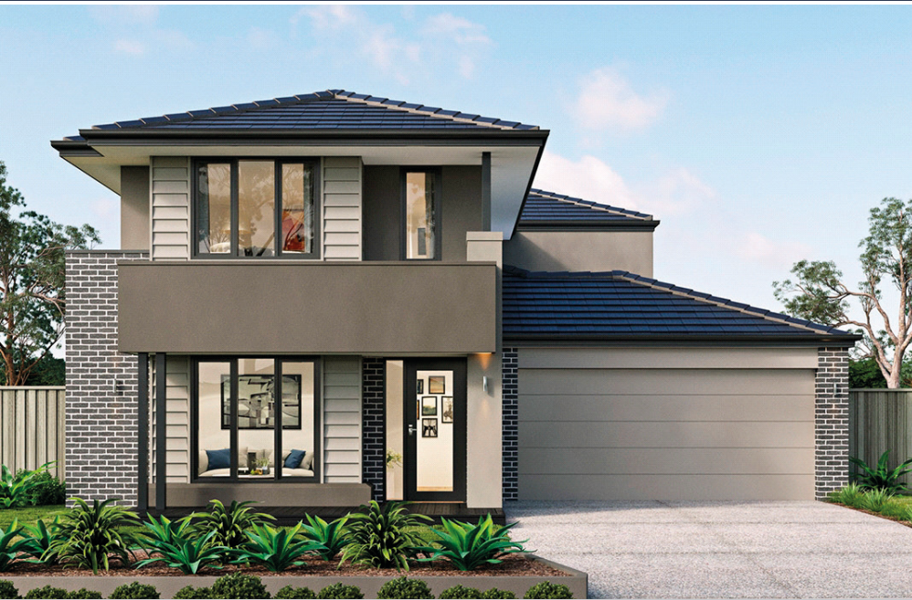
Price excludes: Planter boxes