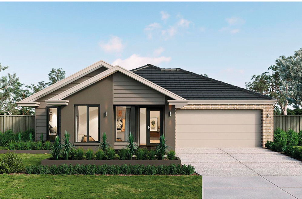
Price excludes: Planter boxes