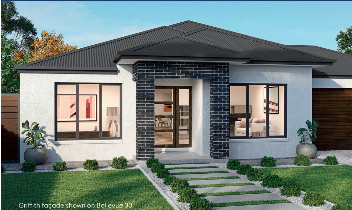
Griffith façade shown on Bellevue 33