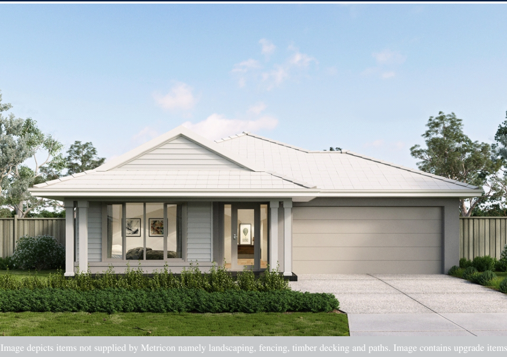
Image depicts items not supplied by Metricon namely landscaping, fencing, timber decking and paths. Image contains upgrade items.