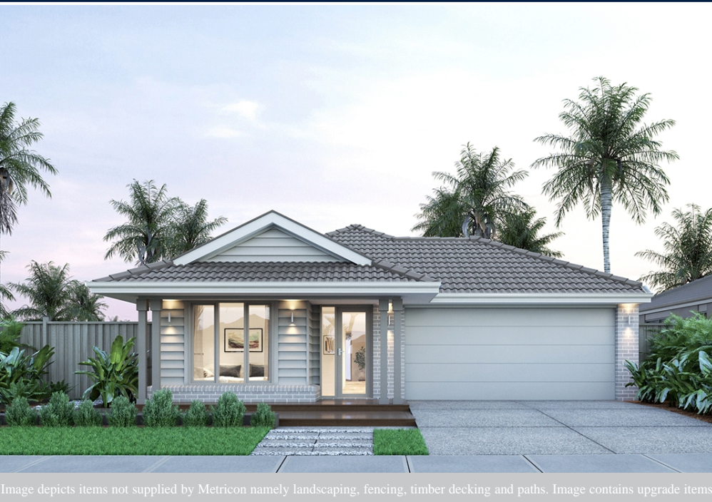
Image depicts items not supplied by Metricon namely landscaping, fencing, timber decking and paths. Image contains upgrade items.