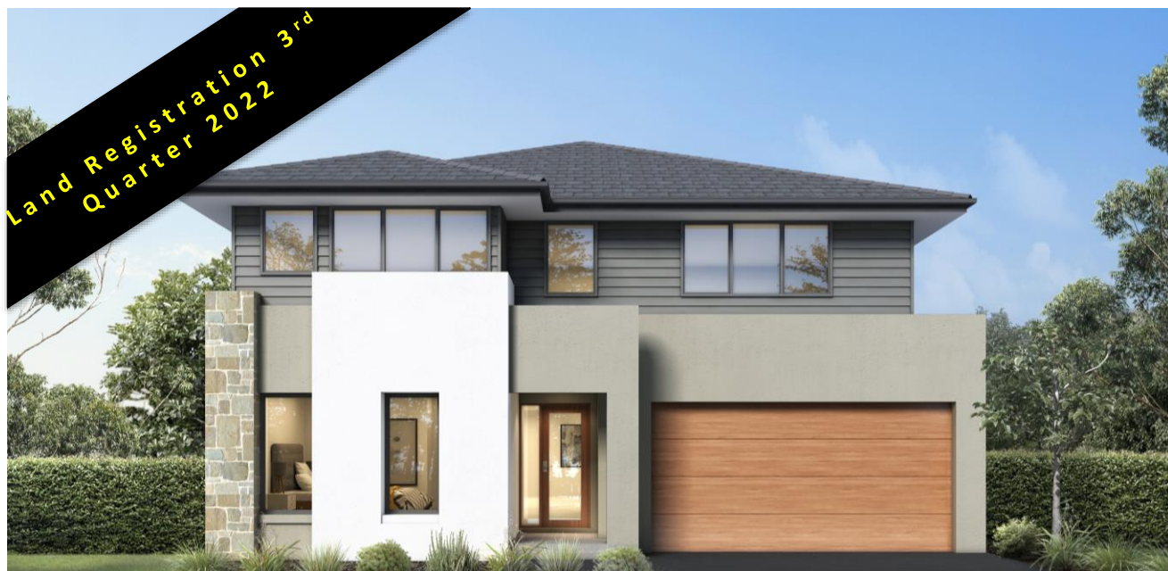
Stamford 36 | Prominent Facade

Facade images and landscaping may vary from this image