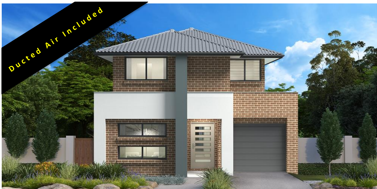
Trevi 21 | Seattle Facade

Facade images and landscaping may vary from this image