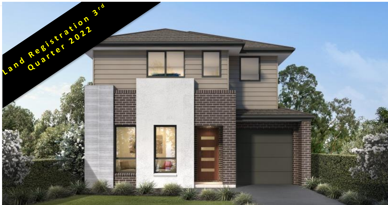
Wembley 26 | Prominent Facade

Facade images and landscaping may vary from this image