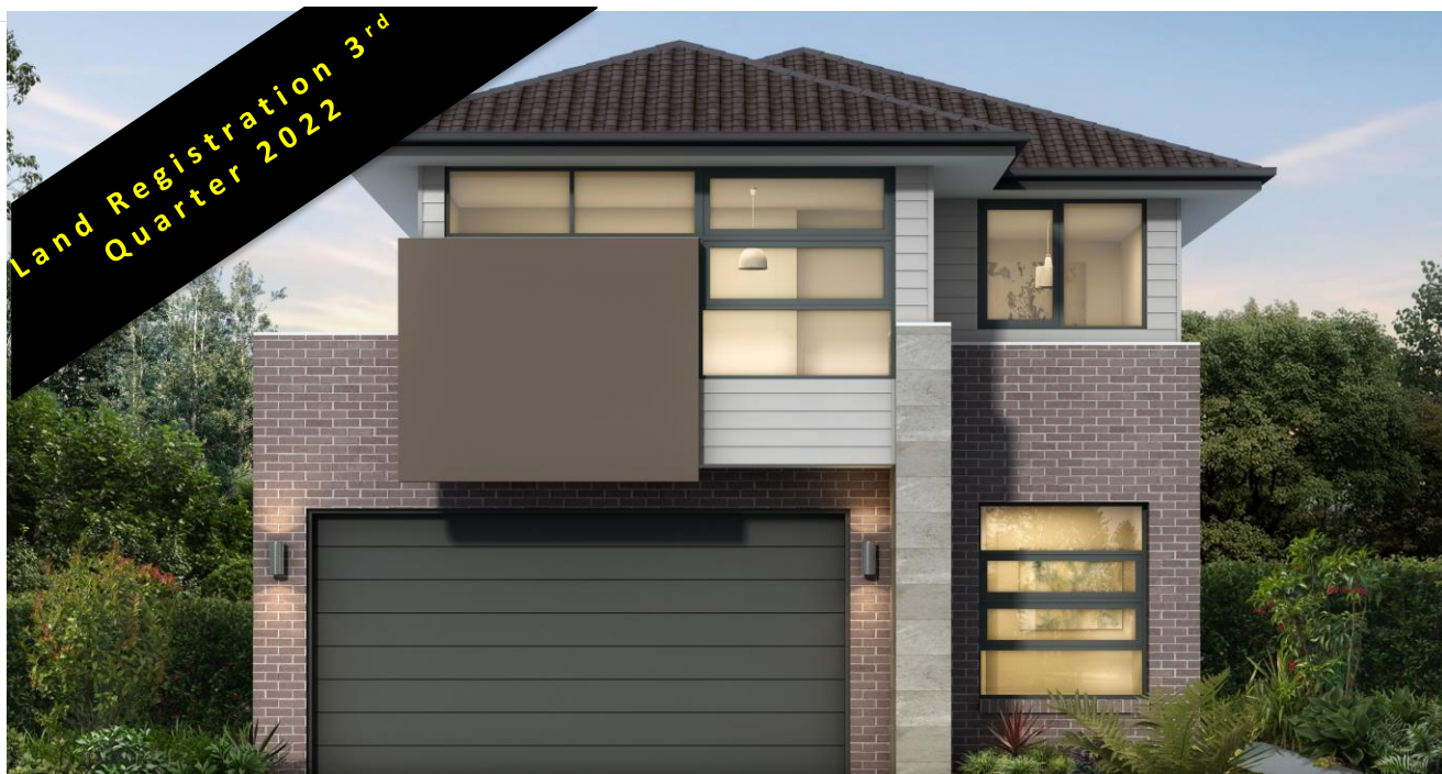
Chiswick 27 | Contemporary Façade

Façade images and landscaping may vary from this image