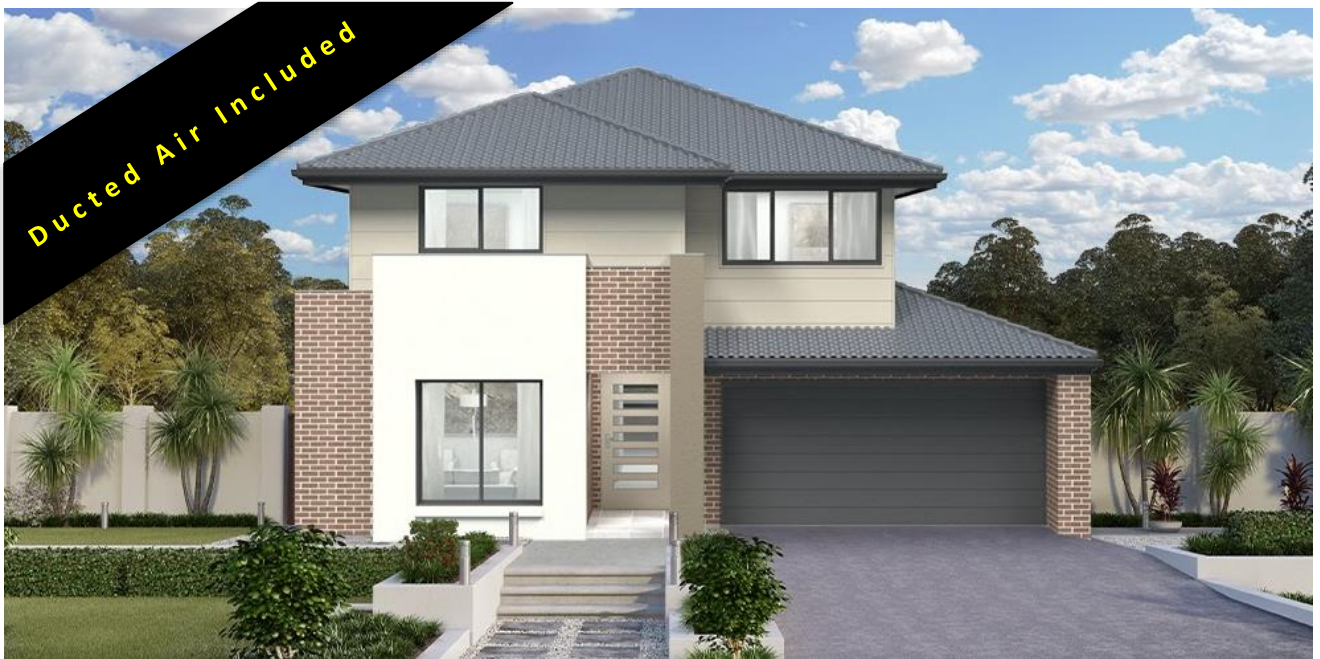
Riviera 30 | Cube Facade

Facade images and landscaping may vary from this image