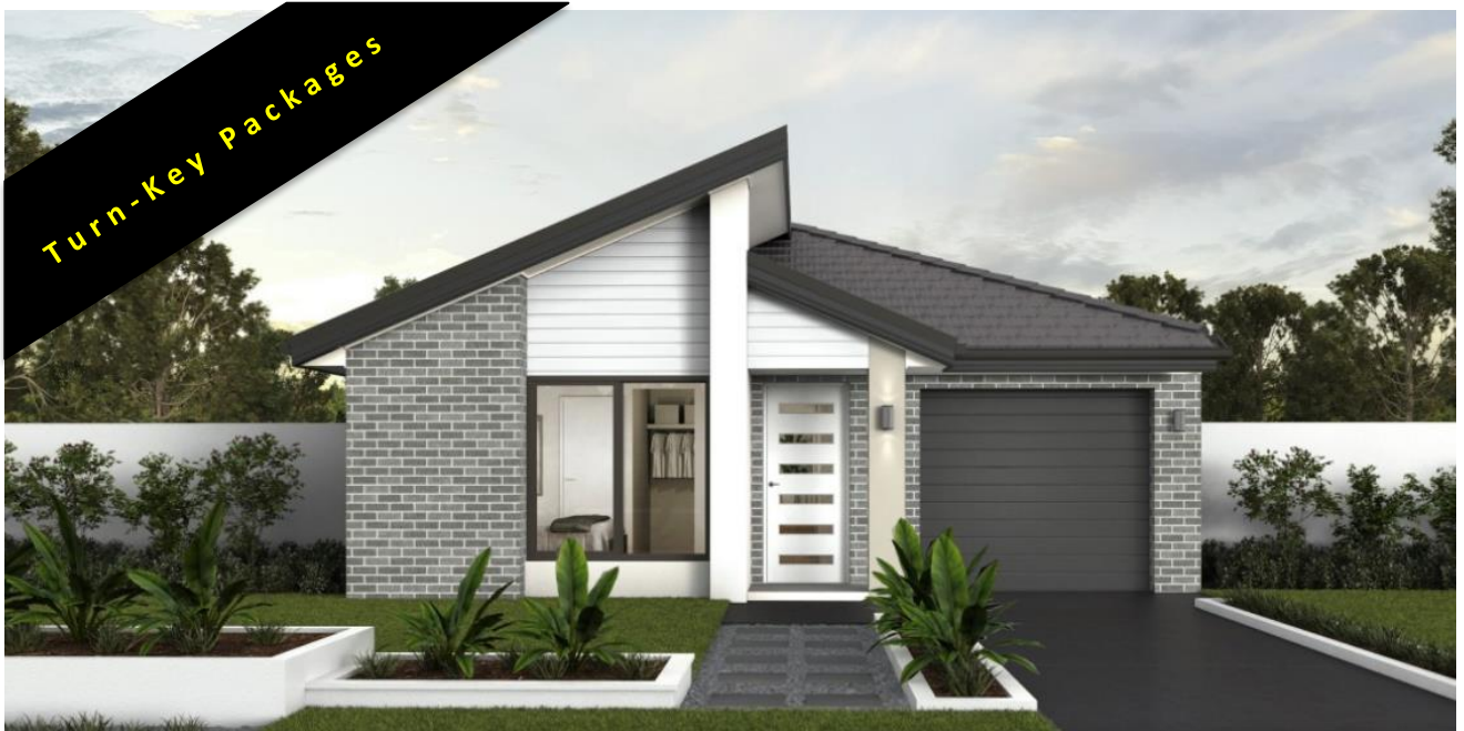
Lyon 19N | Seabreeze Facade

Facade images and landscaping may vary from this image