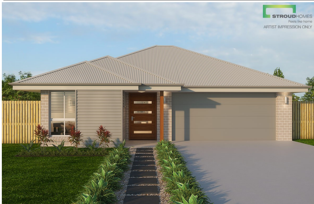
STROUDHOMES Feels like home ARTIST IMPRESSION ONLY