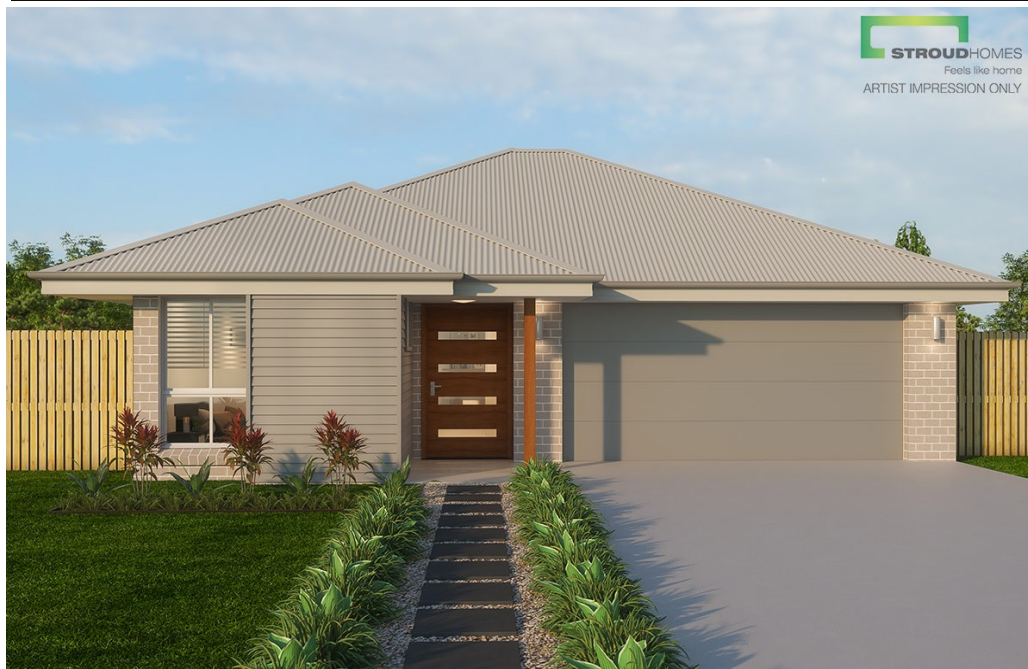
STROUD HOMES Feels like home ARTIST IMPRESSION ONLY