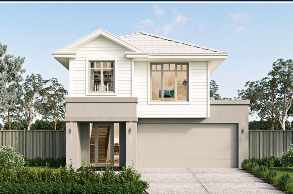
Image depicts items not supplied by Metricon namely landscaping, fencing, timber decking and paths. Image contains upgrade items.