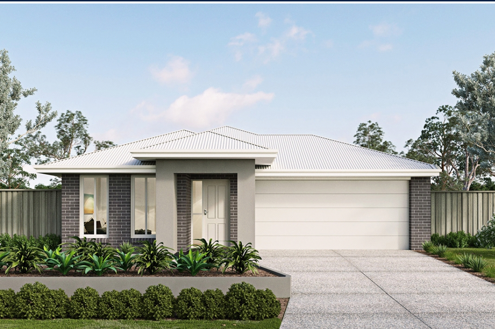
Image depicts items not supplied by Metricon namely landscaping, fencing, timber decking and paths. Image contains upgrade items.