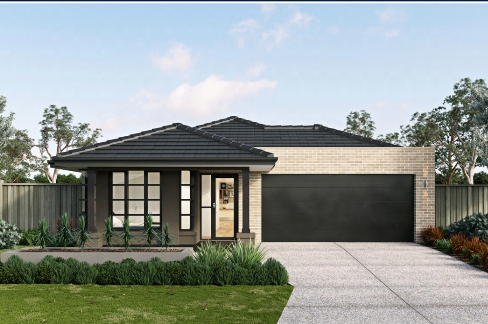
Image depicts items not supplied by Metricon namely landscaping, fencing, timber decking and paths. Image contains upgrade items.