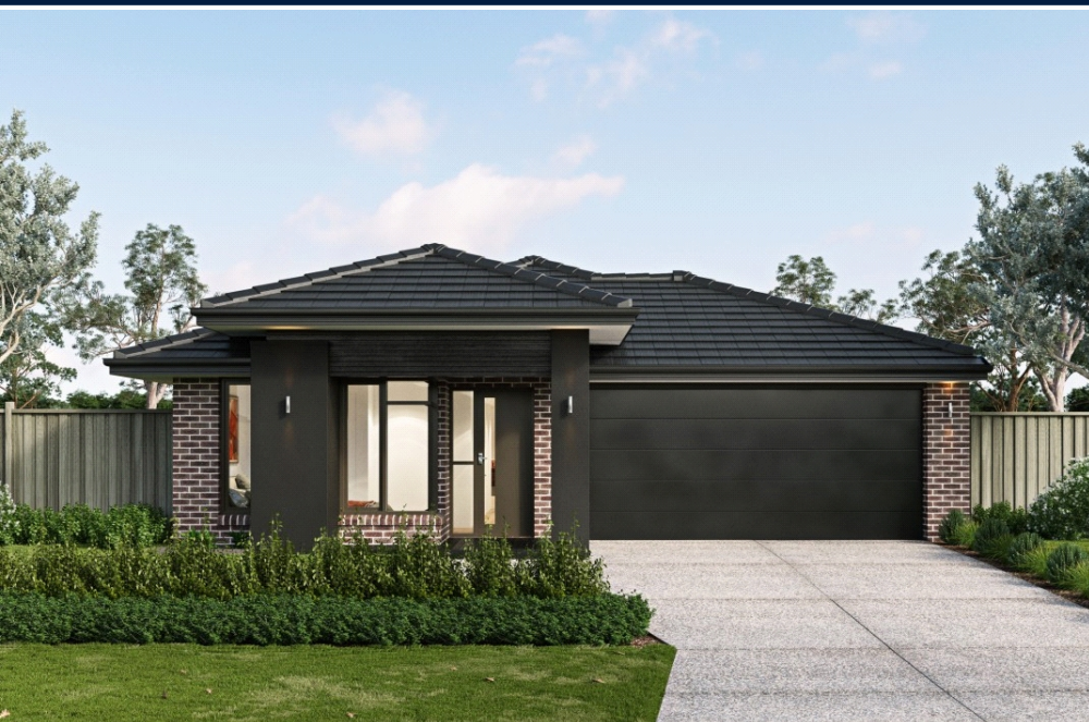
Image depicts items not supplied by Metricon namely landscaping, fencing, timber decking and paths. Image contains upgrade items.