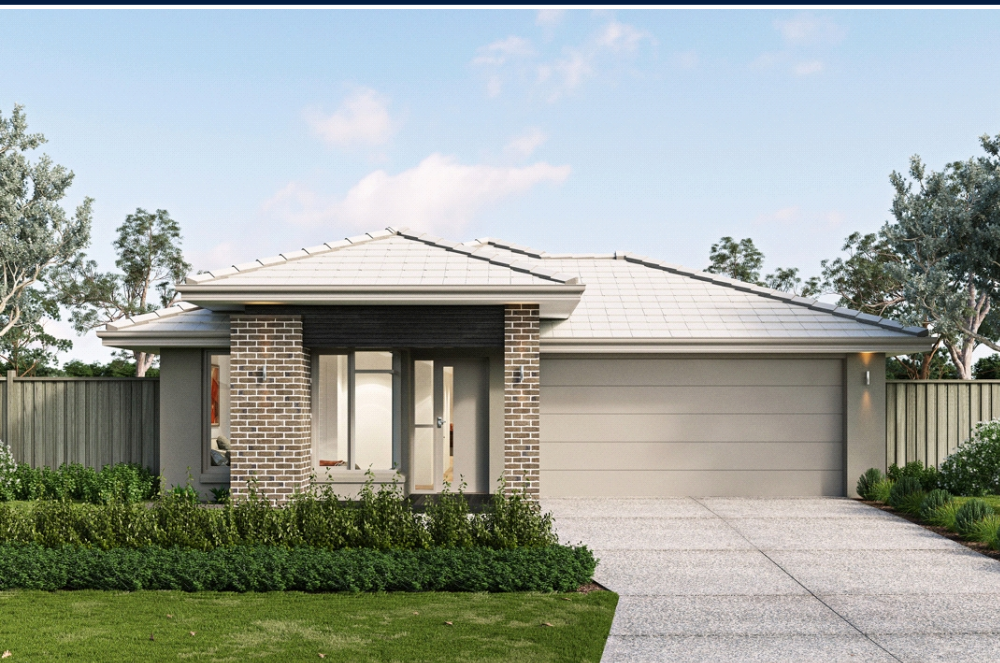
Image depicts items not supplied by Metricon namely landscaping, fencing, timber decking and paths. Image contains upgrade items.